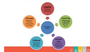
The Five C's of the Entrepreneurship Ecosystem

The slide presentations from the event are available on the post-summit website .